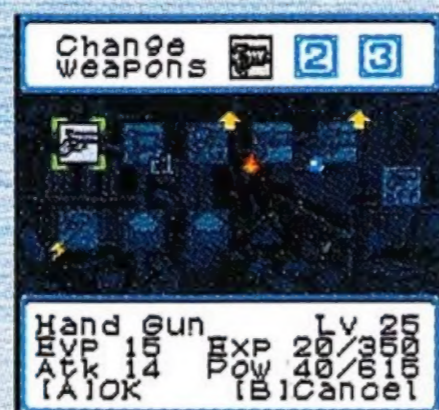
EQUIPMENT SELECTION SCREEN